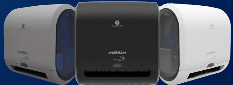
enMotion® Impulse® 8” 1-Roll Automated Touchless Roll Paper Towel Dispensers