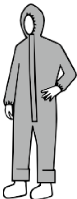
Coverall, taped, hood, elastic face, wrists, sock boots with boot flaps