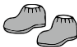
Shoe covers, vinyl sole