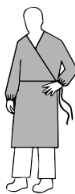
Wrap smock, long sleeves, attached ties, elastic wrists