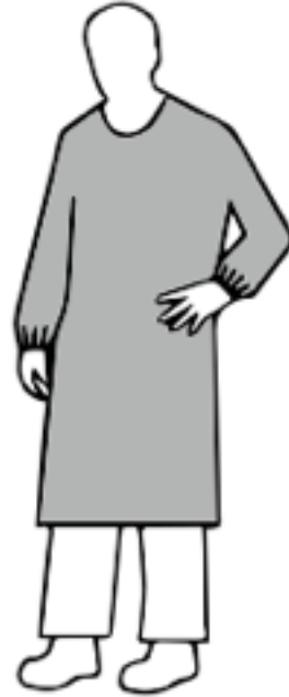
Coat apron with elastic cuffs