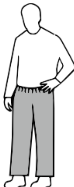
Pants, elastic waist