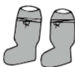
Boot covers with tie tops