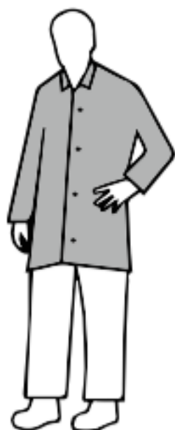
Lab coat, snaps, no pockets, long sleeves