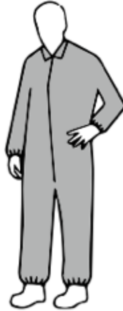
Coverall, collar, zipper, elastic wrists and ankles