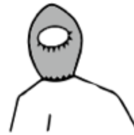
Hood, elastic face & neck