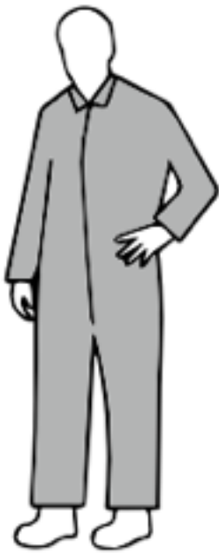
Coverall, collar, zipper