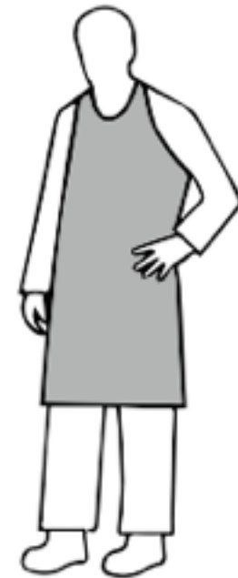
Die cut apron