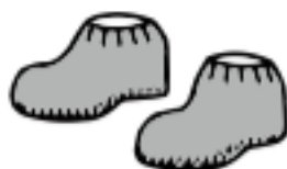
Shoe covers, non-skid soles