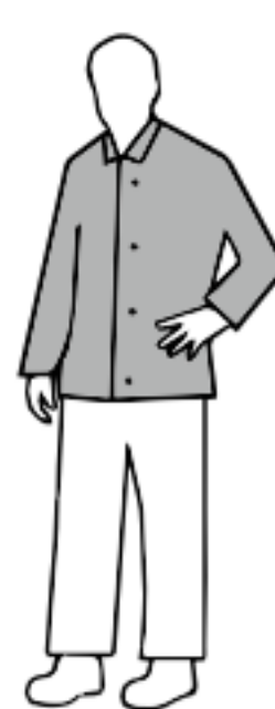
Shirt, snaps, long sleeves