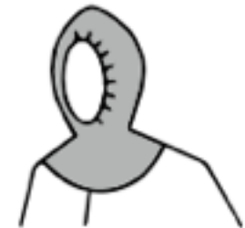
Hood, elastic face, covers shoulders