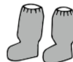
Boot covers with elastic tops