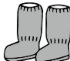
Boot covers with vinyl soles