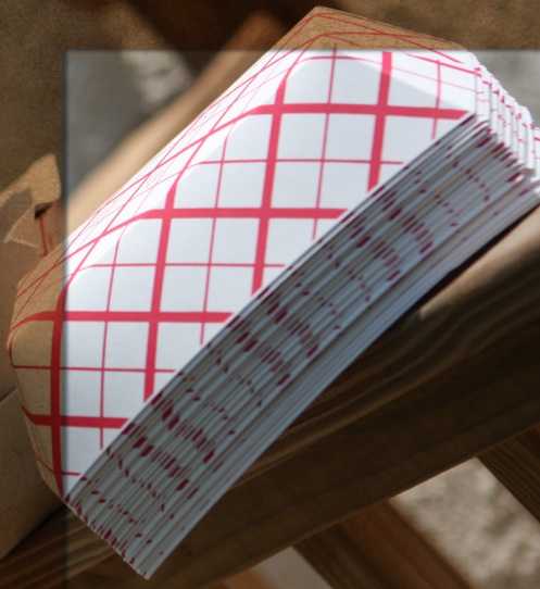
Southland™ Red Check