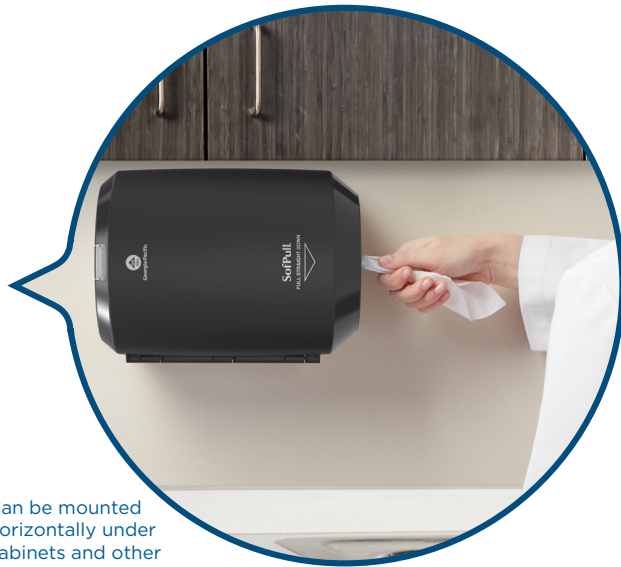
Can be mounted horizontally under cabinets and other tight spaces.

The towels are soft, absorbent and gentle on hands, yet tough enough to clean up messes. And the durable one-towel-at-a-time dispenser helps reduce cross-contamination – and is easy to refill. Plus, it's battery-free.