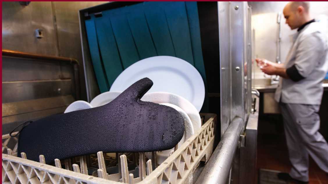
San Jamar's UltiGrips® line of oven mitts are dishwasher safe, keeping a clean look with little effort.