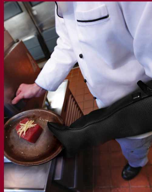
UltiGrips® provide heat protection up to 500°F