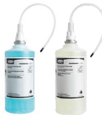
FG750517 / FG750386 FG750389 / FG750390

Green Seal-certified NSF-certified Top-selling item