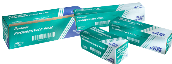
Metal Serrated Cutter