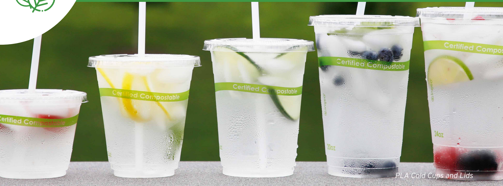
PLA Cold Cups and Lids