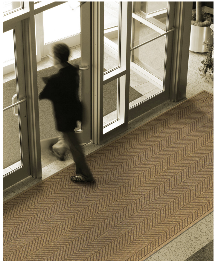
Classic Rubber Border

Mat sizes are approximate as rubber shrinks and expands in conjunction with temperature and time. Tolerable manufacturing size variance is 3-5%.