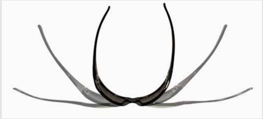
Photo on right shows ProGuard Protective eyewear being bent flat. The eyewear maintains its shape and product integrity under extreme stress.

Our lenses and frames are made from 100% virgin polycarbonate and nylon materials with no fillers. ProGuard protective eyewear is designed to be virtually indestructible.