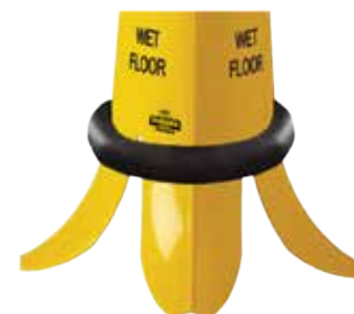
▲ BWR24 BWR36