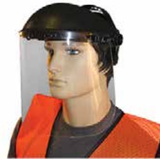
▲ 7337 & 7338