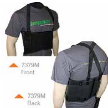
▲ 7379M Front