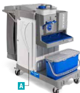
Item# AA1607706U001 22"W x 39"-55"L x 44"H