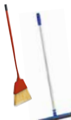
Squeegee & Broom for Floor Collection