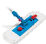
Uniko Pocket Mop