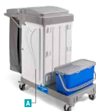
Item# AA1607708U001 22"W x 39"-55"L x 44"H