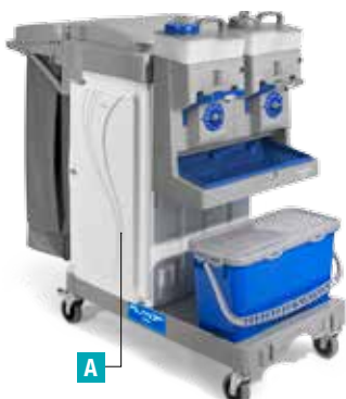
Item# AA1607705U001 22"W x 39"-55"L x 44"H