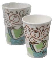
Dixie® PerfectTouch® Paper Hot Cups