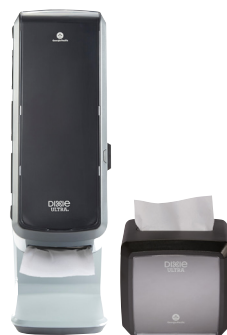
Dixie Ultra® 2-Ply Interfold Napkin Systems