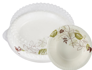
Dixie® Plates, Bowls & Lids