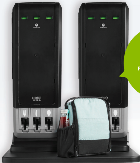
SmartStock® Tri-Tower Cutlery Station: High Capacity Meets Touchless Technology