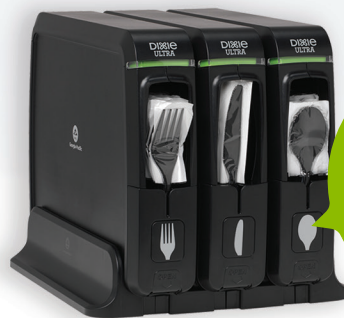
SmartStock® Wrapped Cutlery System: Put the Wrap on Cross Contamination

60% 60% Less Wrap than Fully Wrapped Cutlery. 3