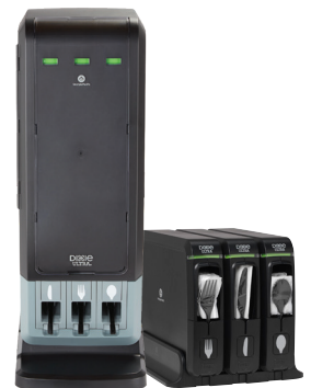
Dixie Ultra® SmartStock® Cutlery Systems