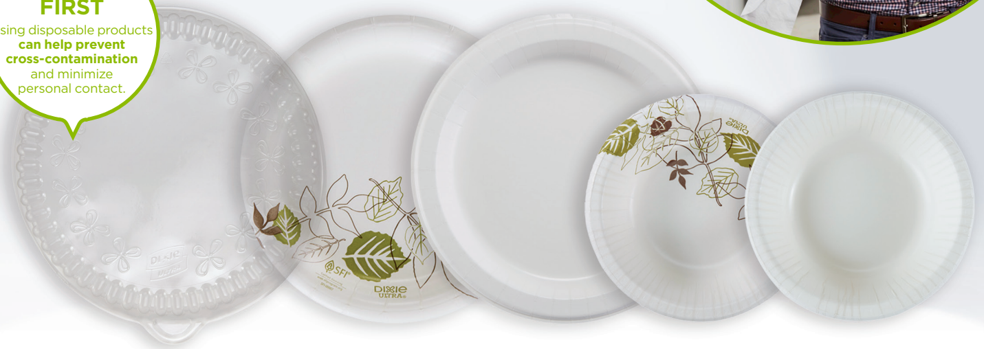
Clear Dome Lids Help Protect Food and Fits Across All Designs

HYGIENE FIRST Using disposable products can help prevent cross-contamination and minimize personal contact.