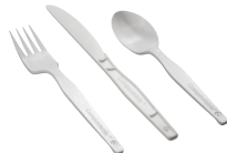
Dixie Ultra® Compostable 6 Cutlery