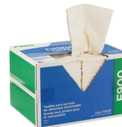
Dixie Ultra® Flax Disposable Foodservice Towels