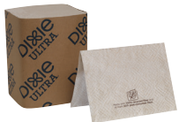
Dixie Ultra® Interfold Eco Print Napkins