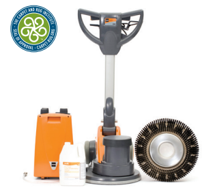
Pictured from left to right: Dry foam generator, Dry Foam Shampoo & Encapsulation Cleaner, Ergodisc 200, Shampoo brush