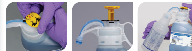
Turn the control knob to select the appropriate icon. Pull up on control knob one time to prime the pump. Push the knob down fully to pump a precise dose of concentrate.

The patent-pending SmartDose™ System allows you to easily, safely and accurately dose concentrated cleaning products. This sustainable solution delivers better cost control than any other current dosing system.