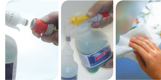
1. Connect to water 2. Fill spray bottle 3. Go!