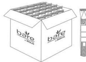
Plastic Sleeve Inners