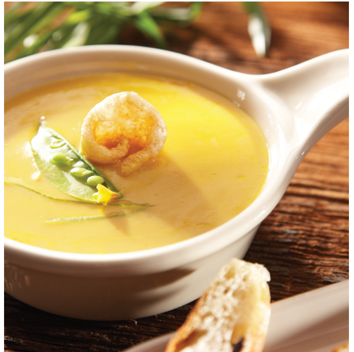
A100P010 Handled Casserole/Tab Soup (11 oz) D 5 3/4" H 1 7/8" w/1 5/8" handle