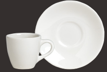
A100P410 A.D. Cup L 3 3/8" H 2 1/2" (3 oz) A100P411 A.D. Saucer D 5"