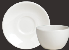
A100P079 Bouillon Cup D 4" H 2 1/2" (9 oz) A100P018 Saucer D 6"