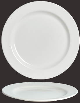
A100P103 Rimmed Plate RE D 10 1/4" A100P401 Rimmed Plate RE D 9 5/8" A100P102 Rimmed Plate RE D 9" A100P101 Rimmed Plate RE D 7 1/2" A100P100 Rimmed Plate RE D 6 1/4"