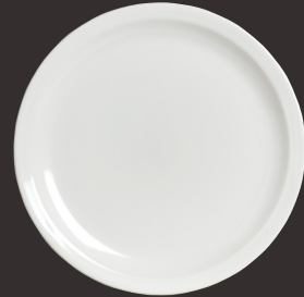
A100P204 Narrow Rim Plate D 10 5/8" A100P202 Narrow Rim Plate D 9 1/4" A100P201 Narrow Rim Plate D 7 1/4" A100P200 Narrow Rim Plate D 6 1/2" A100P206 Narrow Rim Plate D 5 1/2"