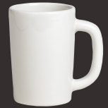
A100P070 Coffee Mug L 4 5/8" H 4 1/2" (9 oz)