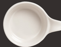
A100P010 Handled Casserole/Tab Soup (11 oz) D 5 3/4" H 1 7/8" w/1 5/8" handle (Clear glaze) A100P011 Handled Casserole/Tab Soup (7 oz) D 4 7/8" H 1 7/8" w/1 1/4" handle (Clear glaze)