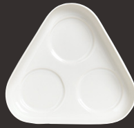
A100P087 Triangle Tray W 7 1/2" w/3 Wells (D 2 5/8" Each Well)