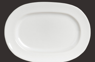
A100P199 Racetrack Oval L 11 1/4" W 8 1/4" (Polar white)

D=Diameter L=Length W=Width H=Height • All Products are Measured at Max Capacity (oz)