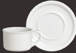
A100P065 Stacking Can Cup L 4 7/8" H 2 3/8" (8 1/2 oz) A100P066 Stacking Saucer D 6 1/2"