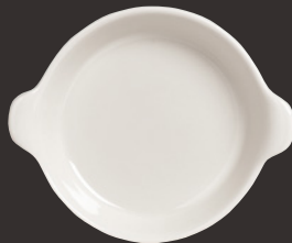
A100P002 Shirred Egg Dish D 7 3/4" (23 oz) (Clear glaze)