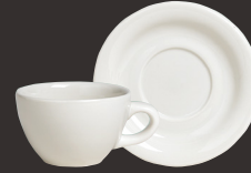
A100P068 Hartford Cup L 4 5/8" H 2 1/4" (7 oz) A100P069 Hartford Saucer D 5 1/2"