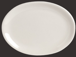
A100P129 Oval Platter L 8" W 6"