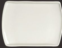
A100P251 Side Platter L 8" W 6"