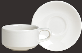
A100P412 Low Cup Stacking L 5 3/4" H 2 5/8" (13 oz) A100P018 Saucer 6"