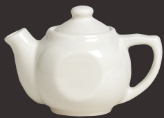
A100P005 Teapot Flat Sided (12 oz) (Clear glaze) A100P012 Lid for Teapot (Clear glaze)