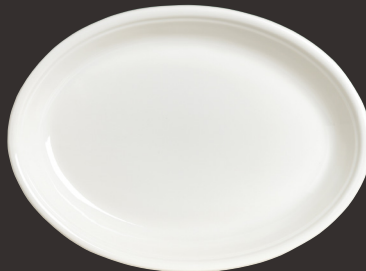
A100P107 Buffet Platter L 19 1/4" W 15" A100P106 Platter L 16" W 12" A100P115 Platter L 14" W 10 1/8"