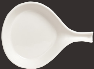
A100P001 Fry Pan Server L 8 1/4" W 7 3/4" H 1 3/8" w/3" handle (18 oz) (Clear glaze)