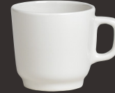
A100P046 Mug L 4 3/4" H 3 1/2" (10 oz)