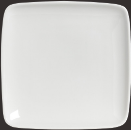
A100P221 Tavola Square Plate L W 11 3/8" A100P222 Tavola Square Plate L W 10 5/8" A100P220 Tavola Square Plate L W 9 7/8" A100P219 Tavola Square Plate L W 8 1/2" A100P218 Tavola Square Plate L W 6 3/4"