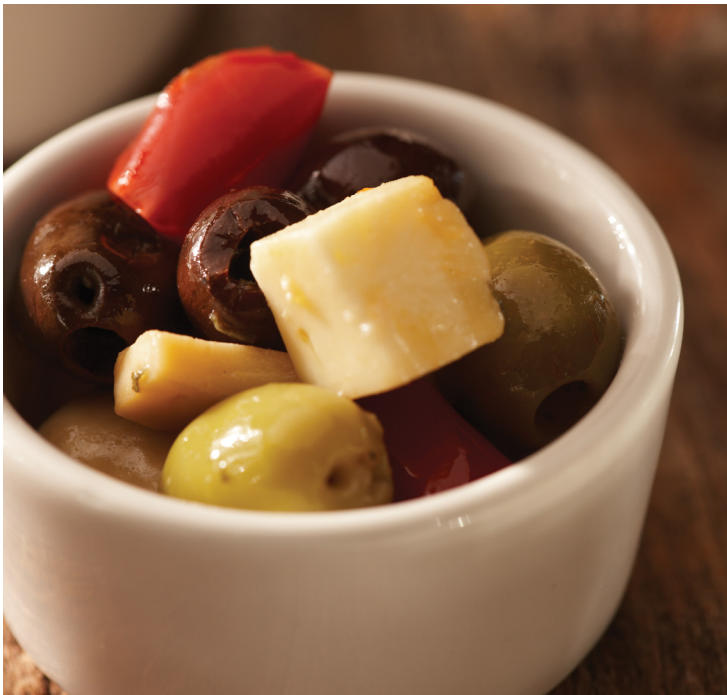
A100P086 Salsa Dish D 3 1/8" H 1 1/2" (3 oz)