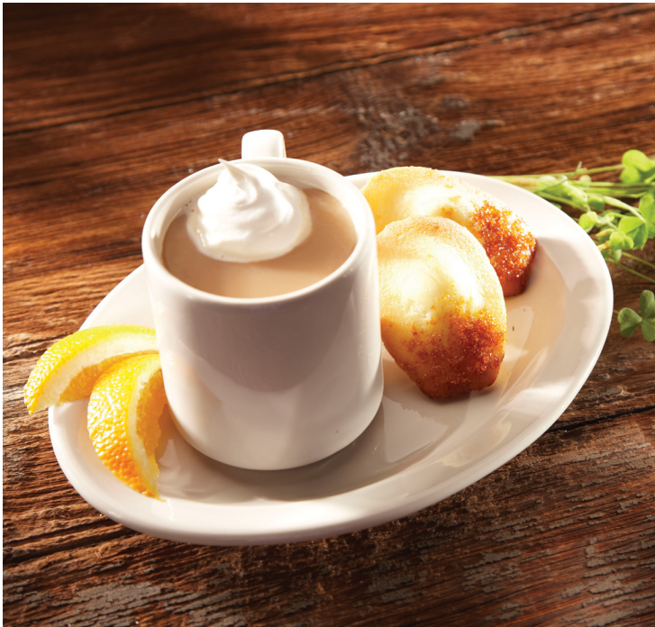
A100P049 Acapulco Mug W 4 3/4" H 3 1/2" (10 oz) A100P201 Narrow Rim Plate D 7 1/4"