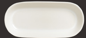
A100P004 Celery Tray L 10" W 4 3/4" H 1 1/8" A100P003 Celery Tray L 7 5/8" W 3 1/2" H 1 1/8"