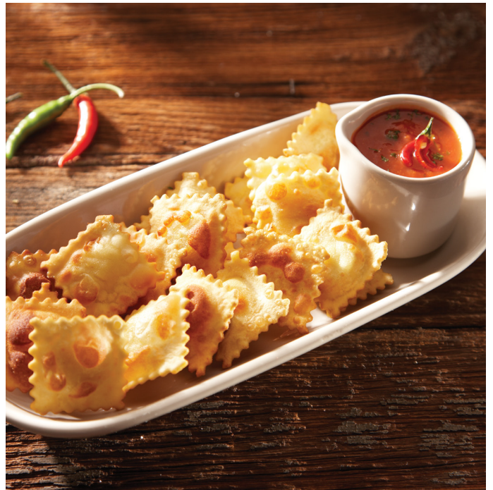
A100P004 Celery Tray L 10" W 4 3/4" H 1 1/8" A100P080 Astro Creamer L 2 3/8" W 2 1/4" (2 3/8 oz)