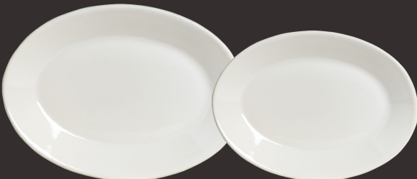
A100P148 Oval Platter RE L 15 1/2" W 11" A100P144 Oval Platter RE L 15" W 11 1/4" A100P145 Oval Platter RE L 13 1/2" W 9 1/4" A100P142 Oval Platter RE L 12 1/4" W 9 1/8" A100P147 Oval Platter RE L 11 1/4" W 8" A100P140 Oval Platter RE L 10 5/8" W 7 3/4" A100P138 Oval Platter RE L 9 3/8" W 6 1/2" A100P139 Oval Platter RE L 9" W 7"