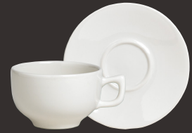
A100P071 Jumbo Latte Cup L 5 5/8" H 2 7/8" (13 oz) A100P072 Jumbo Latte Saucer D 7"