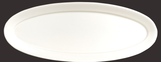
A100P108 Salmon Platter L 22 1/2" W 9"