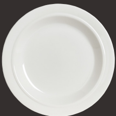
A100P364 Rimmed Pasta Bowl D 11 1/4" H 1 1/4" (18 oz) (Clear glaze)