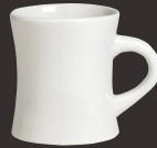
A100P299 Hourglass Mug (11 oz)