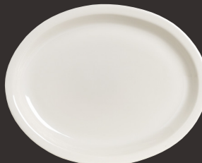
A100P245 Narrow Rim Platter L 13 1/2" W 10 3/4" A100P242 Narrow Rim Platter L 11 3/8" W 9"