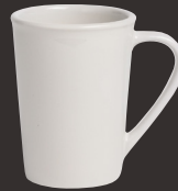
A100P038 Conical Mug L 4 7/8" H 4 5/8" (12 oz)