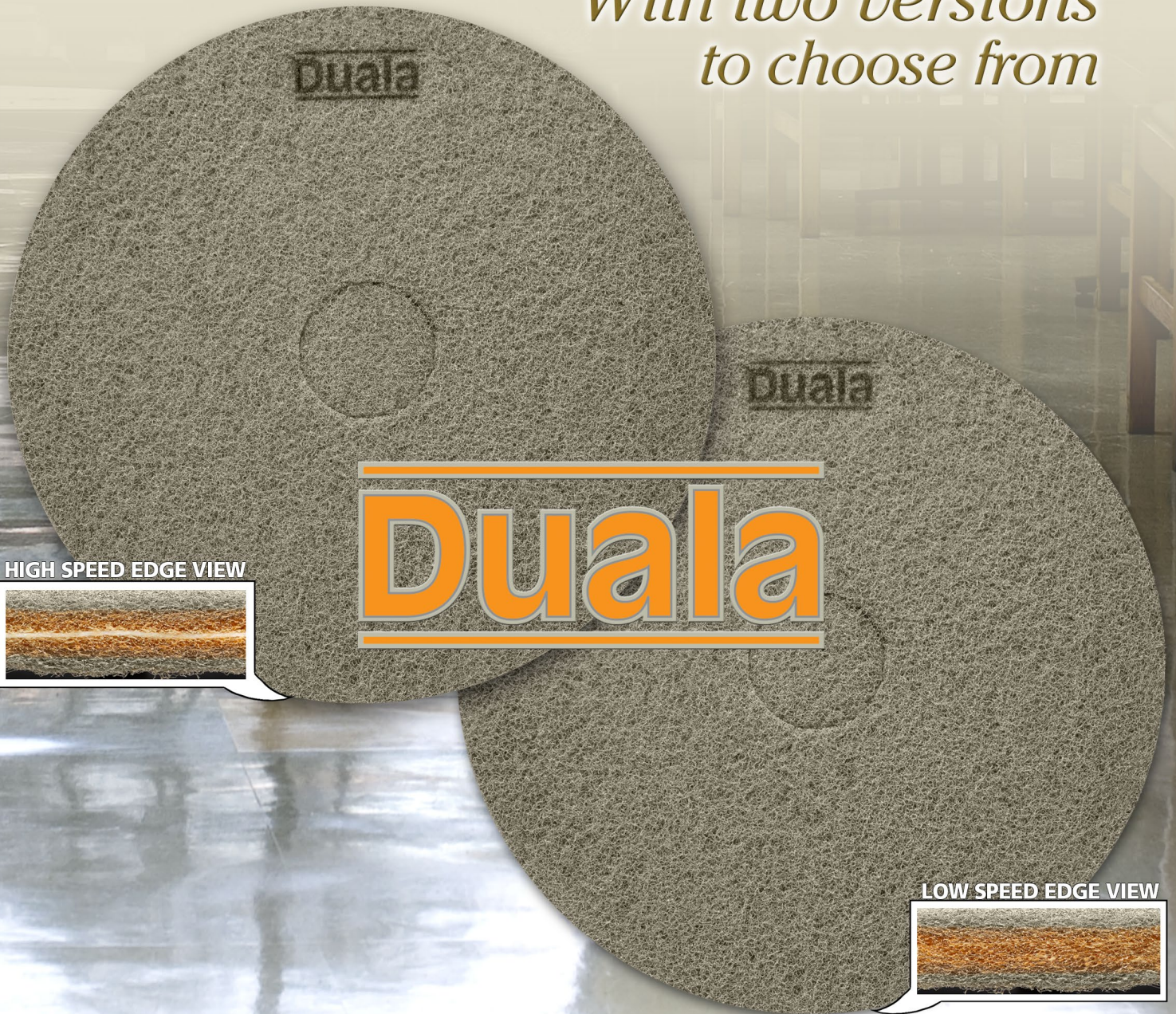
HIGH SPEED EDGE VIEW